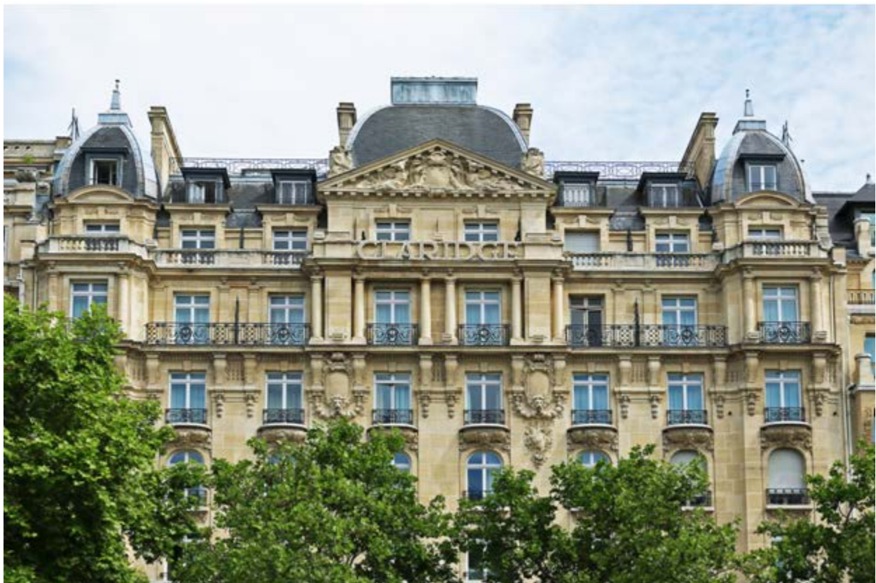
Fraser Suites Le Claridge Champs-Elysees

Inventory set to double to 30,000 residence units by the time Frasers Hospitality turns 21