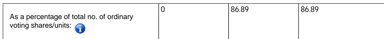
Table 8. Others